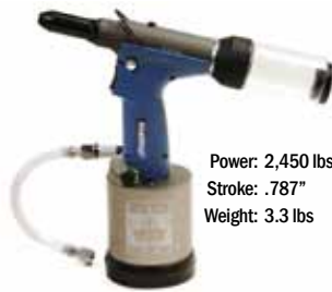
RK-8000S 5/32" MAX.

Power: 2,450 lbsF Stroke: .787" Weight: 3.3 lbs